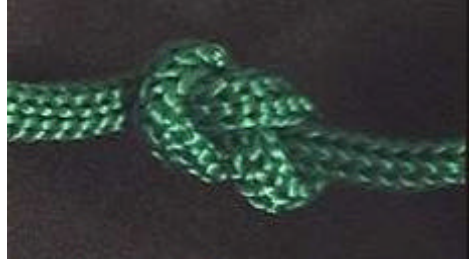
Figure of Eight

This is essentially formed when you do an extra turn to an Overhand Knot. It is a more solid knot than the Overhand Knot and